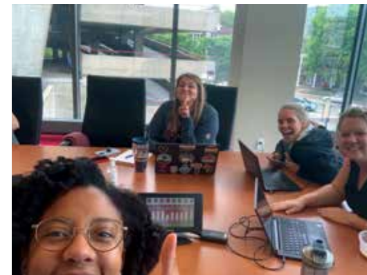
2022 Virtual APPLE team from the University of Wisconsin-Madison.

culture. We’re excited to host APPLE in person in March 2023 in Charlottesville, VA. Here’s what our participants had to say: