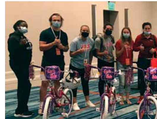
Division II APPLE participants team build while building kids' bikes for charity.