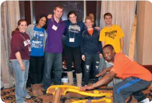
A team building competition to create the best mini-golf hole

The APPLE conferences, sponsored by the National Collegiate Athletics Association (NCAA) and conducted since 1992 by the Gordie Center, are the leading national training symposia dedicated to substance abuse prevention and health promotion for student-athletes and athletics department