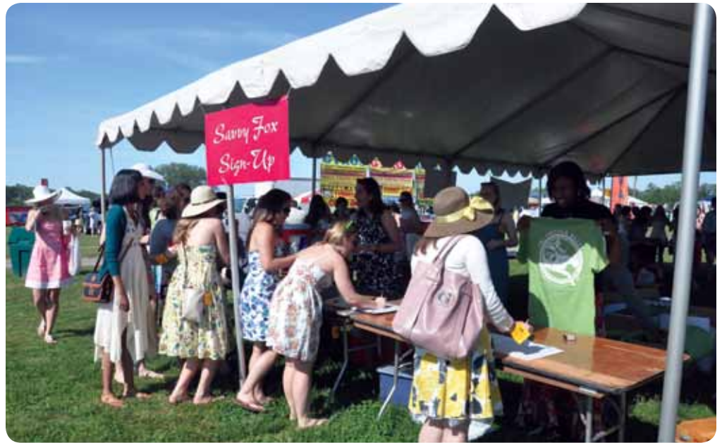
ADAPT members promote the Savvy Fox sober driver pledge at the Foxfield Races