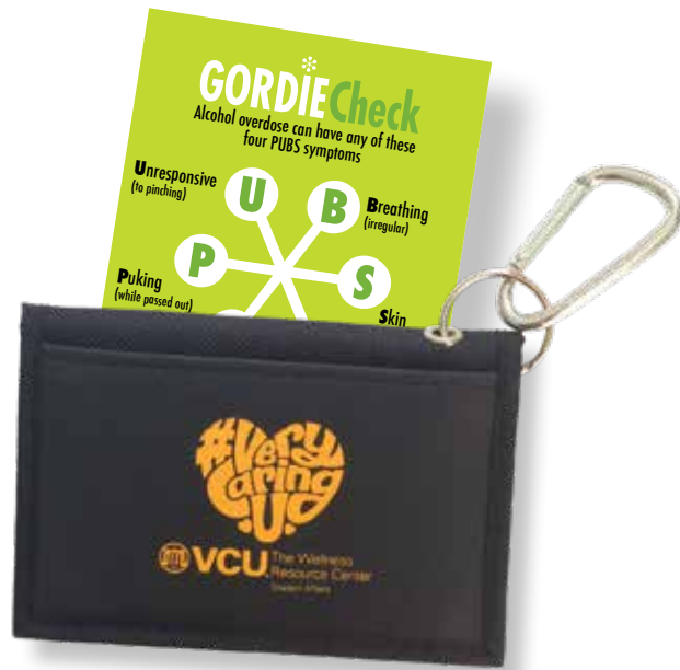
Above: VCU Wellness Resource Center safety wallet and a GORDIEcheck BAC card. Below: VCU campus